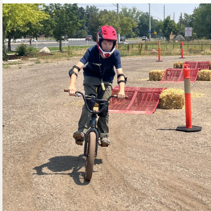
Liam Payne doing BMX