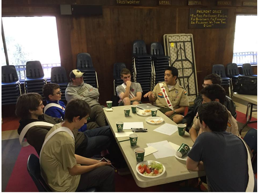
Talking about the future of Ohlone Lodge at the Winter Fellowship