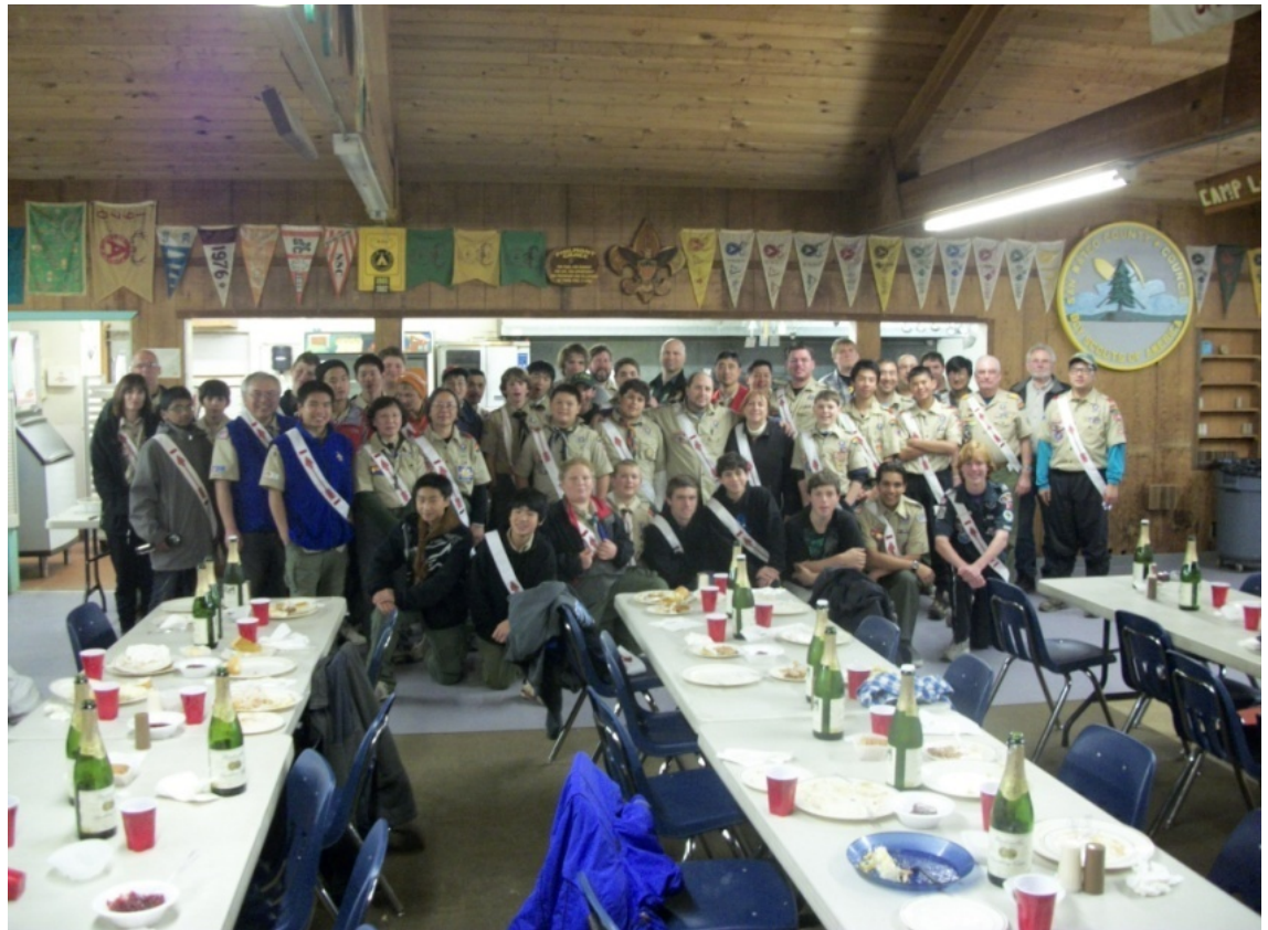
Sign of Ordeal Membership, and the Arrow Handclasp.

1. Memorize the signs of Arrow membership. Memorize the Order of the Arrow Official Song, the Admonition, the