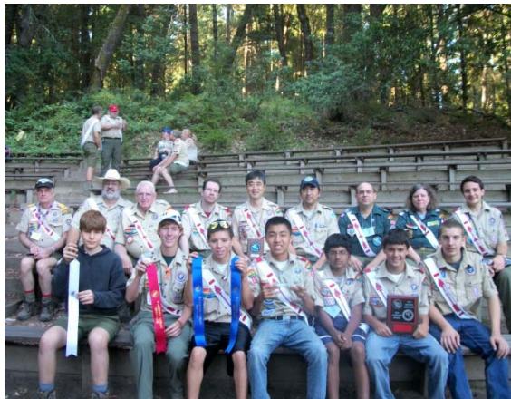
Above: Members of Ohlone Lodge display some of the awards won at the Section Conclave.