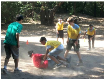
Above: Ohlone rockin' at Indian Handball. Below: Charge!!! Slam that dodgeball!