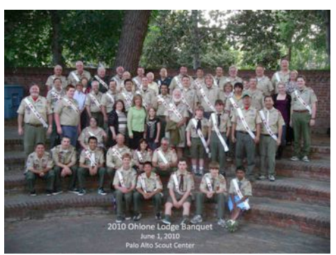
Lodge members and families in attendance at the Annual Lodge Banquet on June 1.

While we on the LEC can usually find some interesting articles to include in each issue, the OtterSide needs YOUR help! Email articles or ideas to publications@ohlone63.org and have them printed!