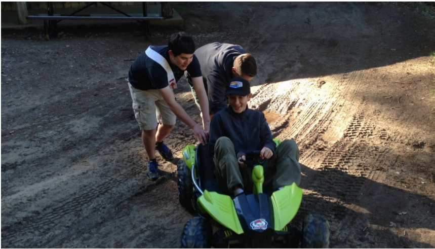
Past Fun at Last Year's Winter Fellowship